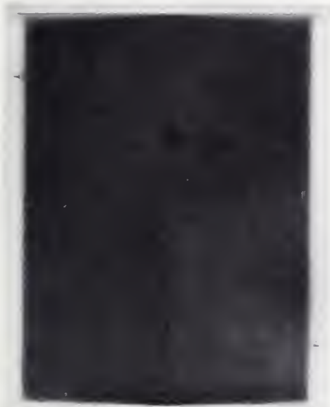
Christopher W. Smith, Clearing #1 of Nine Clearings for a Standing Man , 1973

were altered in the rich interchange between previously differentiated art forms. A realism unabashedly based on photography and on the vernacular American environment emerged. The positions of photography and the craft media, particularly clay, were re-evaluated and upgraded. By 1970 a major cultural shift was noticed and named. It was given the alternative designations of Post-Modernism and Post Minimalism, which remain the only terms general enough to describe the pluralism that has ensued.